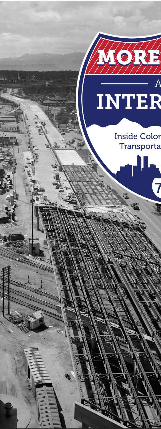
Construction of the I-70 viaduct in 1963