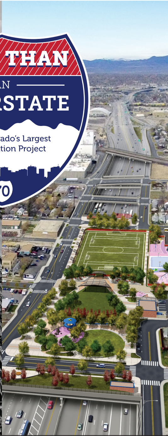
Rendering of I-70 nearly 60 years later